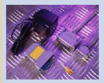
Cable Extender part no. 105-604 The cable extender kit allows up to 1,200 metres of cable distance between the PC and the AX100.